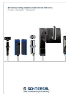
Pulse Echo Products Catalog 156 pages